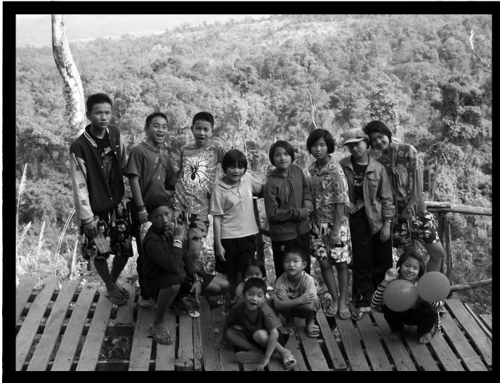
Camping in Nong Khai during school break

VCDF also treated our kids to a few camps this year. Earlier this year, 25 of our kids who attend boarding schools in the North–East went on a camping tour of natural and historical sites during a 10–day break from school.