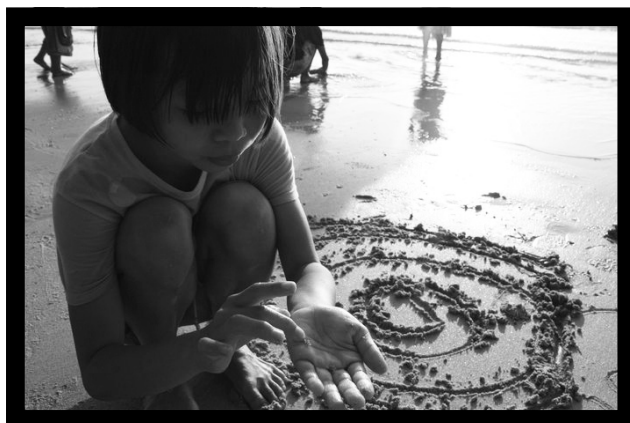
Phone drawing in the sand

Though liquid fertilizers do sound like a good time, our kids also participated in a handful of other fun activities this summer. 30 children from our Chiang Mai Drop-In Center and Children's Home made the long trip down to the beach! Car-sickness aside, our kids had a great time seeing the ocean for the first time. They also visited a giant aquarium and got to eat fresh seafood. The trip was funded by donations and a large piggy-bank that our kids would put a few coins in each day after school for a year! They were glad that they didn't spend their coins on video games as they really enjoyed themselves at the beach.