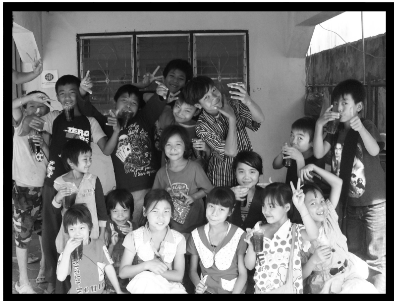
Kids at our Mae Sai Drop-In Center after completing their morning school lessons

Work in both of our Drop-In Centers in Chiang Mai and Mae Sai has been going well. During the day, each location works with 10-30 children under the age of 14 to give them an informal education and keep them safe and off of the streets. In the evenings, our staff take to the streets and visit at-risk kids, youth and adults and administer first-aid, conduct HIV/AIDS awareness activities and build upon their strong rapport and relationships. Through these outings, our staff learn more about each individual's problems and offer advice which will hopefully lead them to take advantage of VCDF's services.