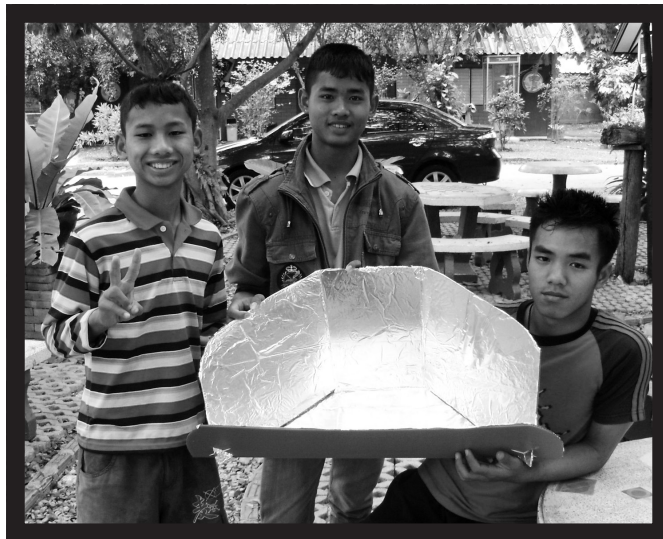
Showing off their newly made solar oven

Over their summer break, our kids have gone on a few trips, visited any family they may have and participated in a number of activities at the Children's Homes. Eight children and three staff attended a training seminar at the YMCA Northern Development Foundation's Energy Learning Center which focused on environmentally-friendly vocational skills and how to consume less energy at the Children's Home in Chiang Saen. They learned how to make a bio-gas system, a water pump powered by bicycles and a solar oven that can boil water. They also got hands-on experience and learned about liquid fertilizers and Efficient Microorganisms, mushroom cultivation and pig-farming.